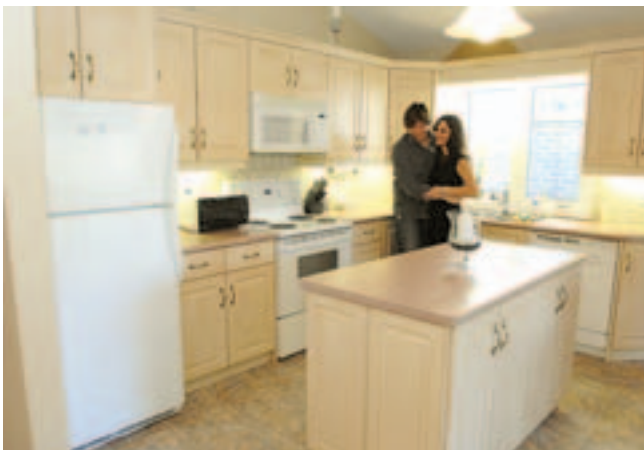
The couple plan to replace the appliances and cabinets in the kitchen.