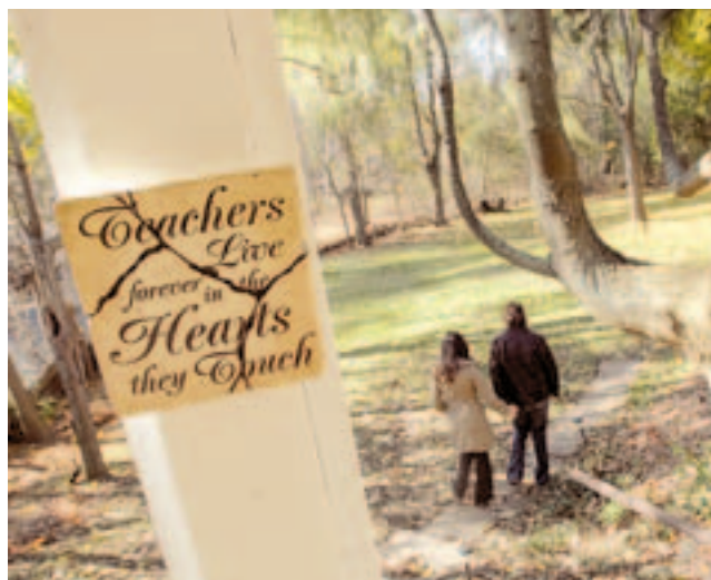
The half-acre lot has mature trees, ravine and stream.