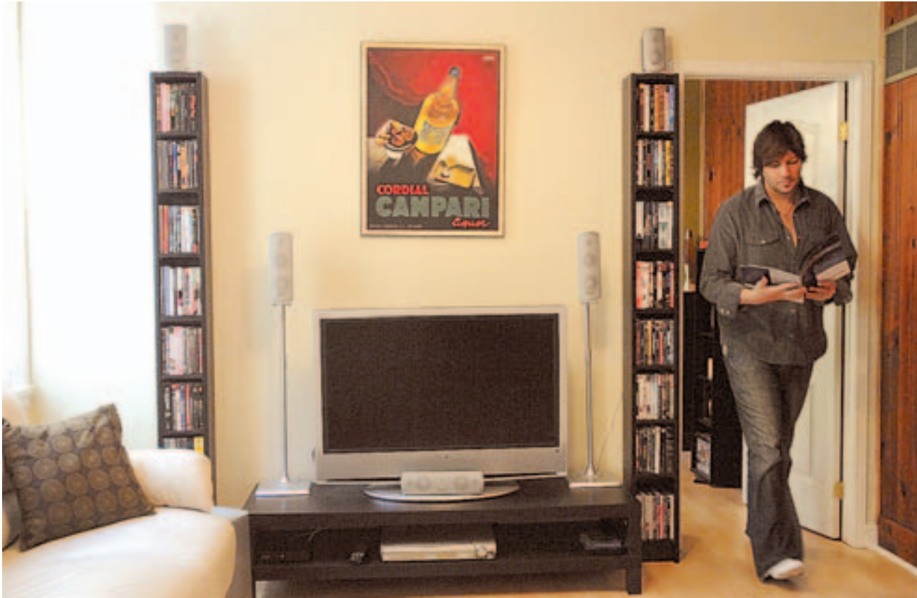
The finished basement has an office and TV room.